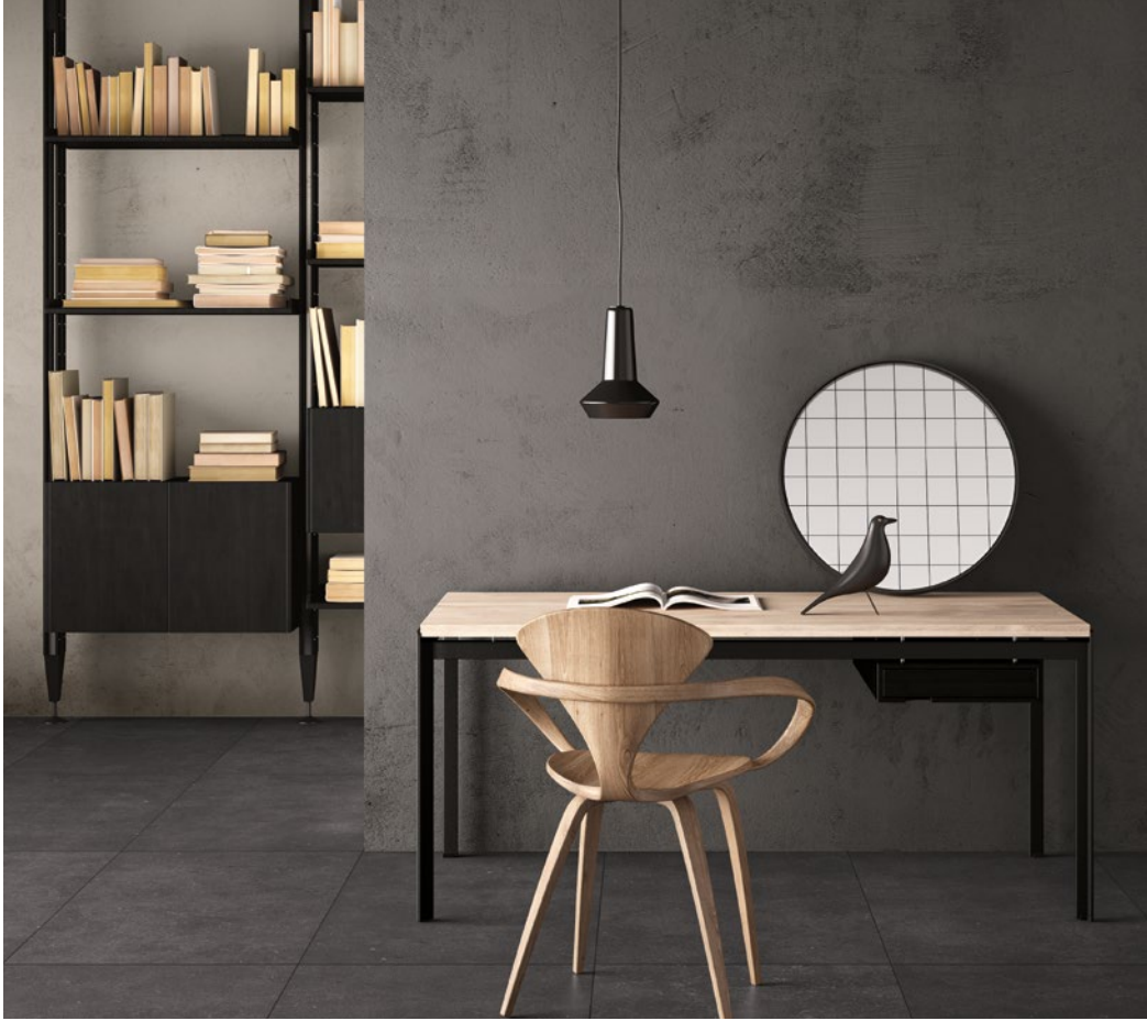
ABOVE Floor: 3PPK101