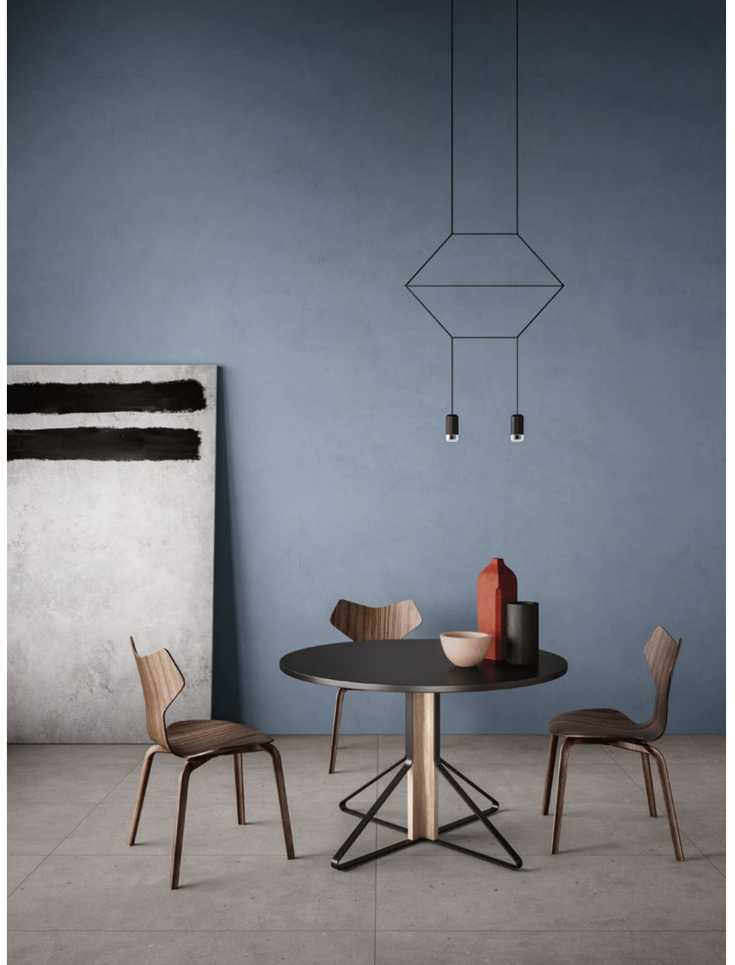
RIGHT Floor: 3PPK102