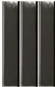
Monkhill * 5TRB117