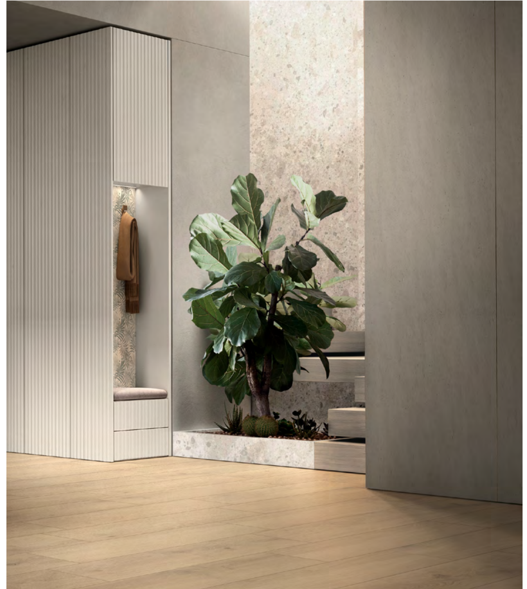
ABOVE Floor: 3CNP101