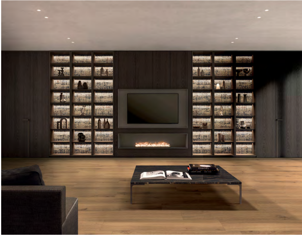
ABOVE Floor: 3CNP104