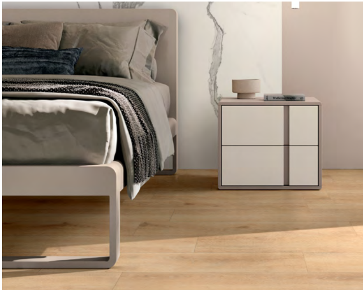
RIGHT Floor: 3CNP102