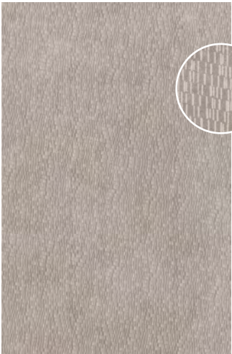
CTY-New York 2CTY101