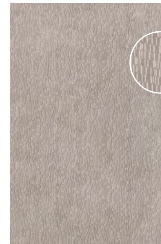
CTY-New York 2CTY101