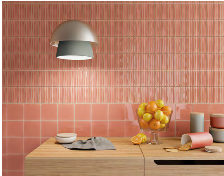
RIGHT Wall: 5CLR108