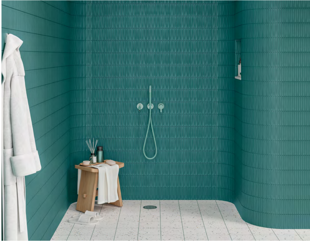
ABOVE Wall: 5CLR112