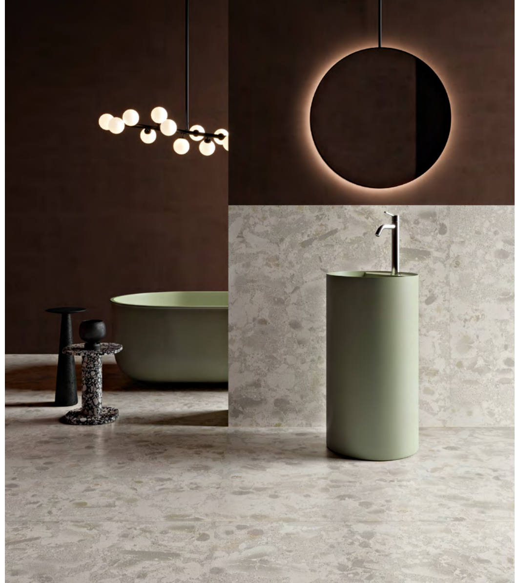
ABOVE Floor: 2COM102 Wall: 2COM102