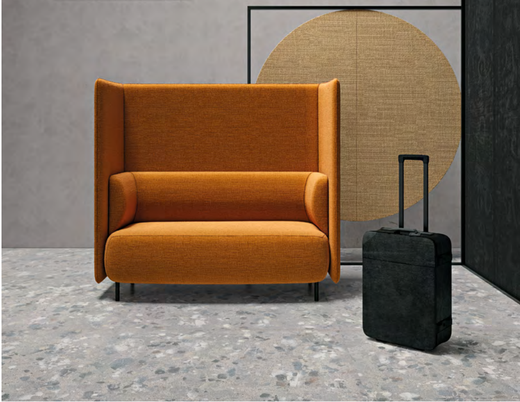
ABOVE Floor: 2COM103