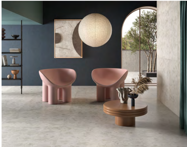
RIGHT Floor: 2COM102 Wall: 2COM102