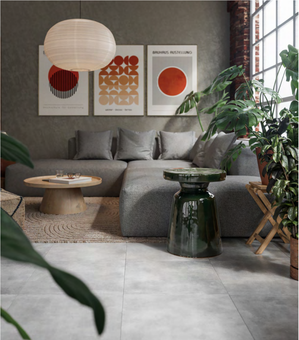
ABOVE Floor: 2CFN104