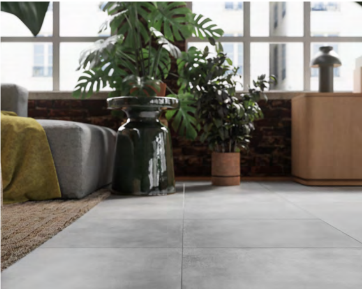
RIGHT Floor: 2CFN104