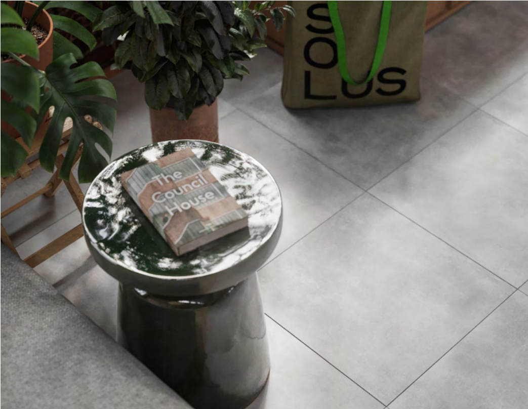
ABOVE Floor: 2CFN104