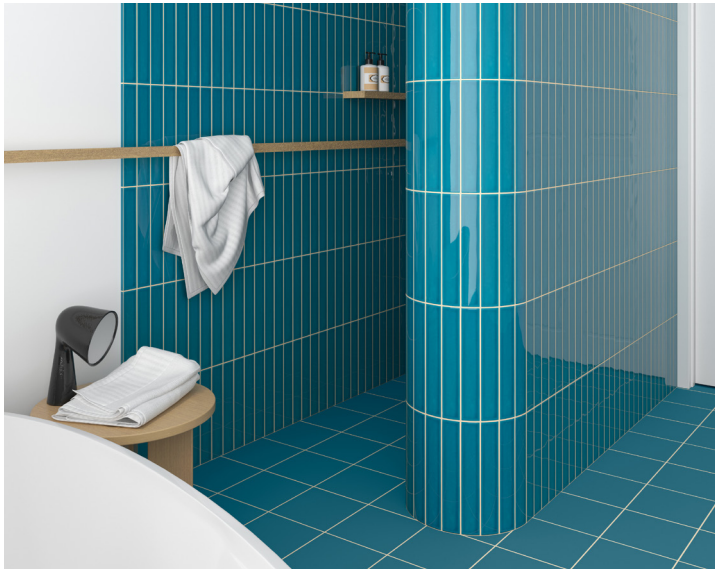
RIGHT Wall: 5CNC108