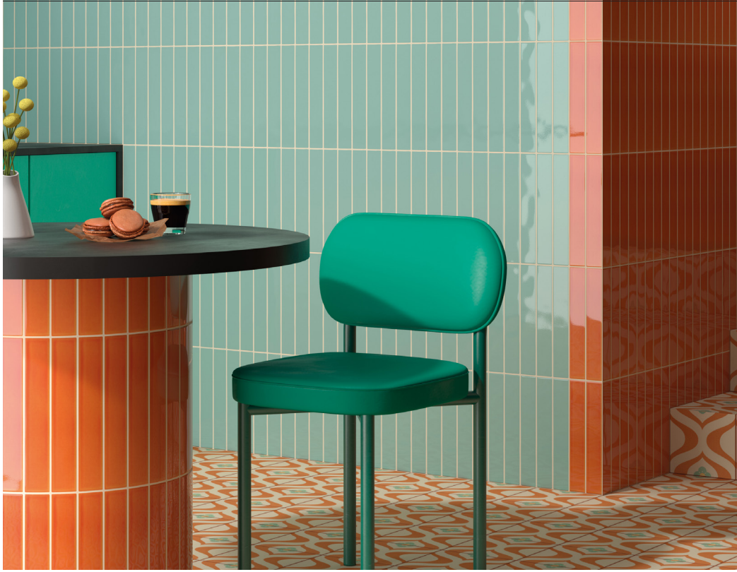
ABOVE Wall: 5CNC105 5CNC107