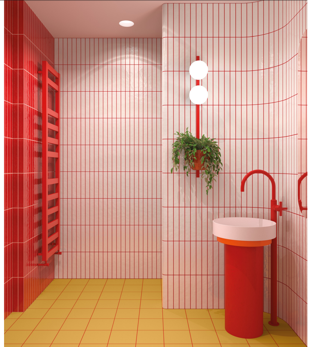
ABOVE Wall: 5CNC110 5CNC101