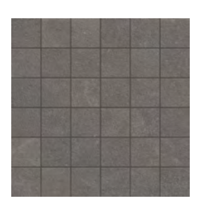
Mosaic All colours 300x300x9mm Matt R10