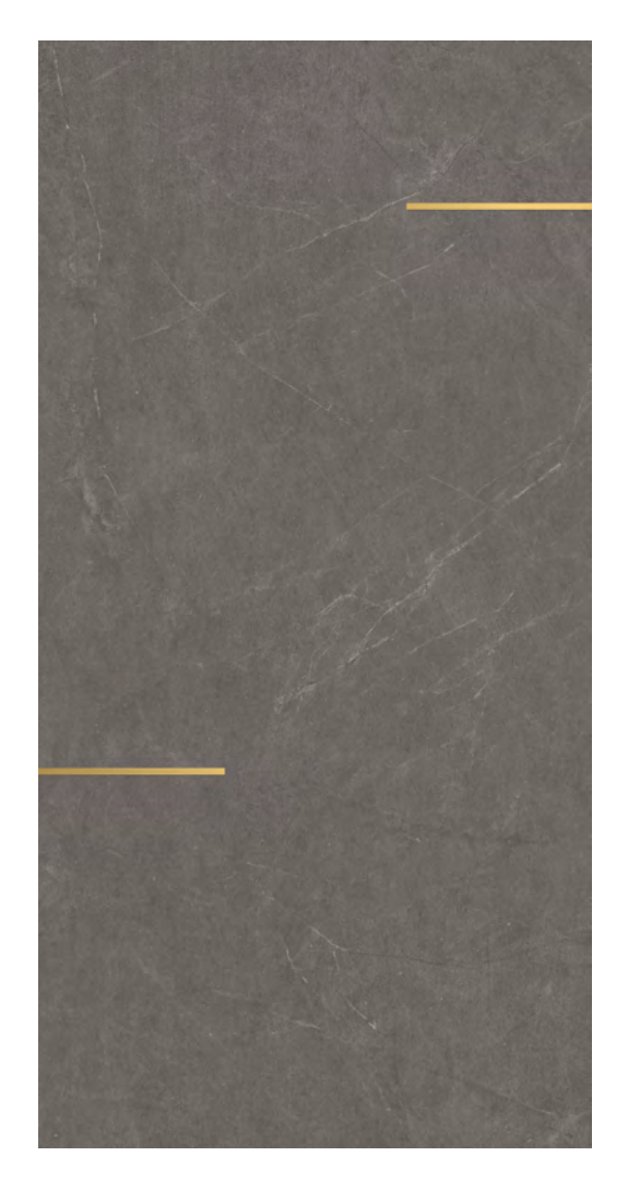
Decor B All colours 600x1200x9mm Matt R10