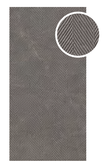
Decor A All colours 300x600x9mm Textured R10