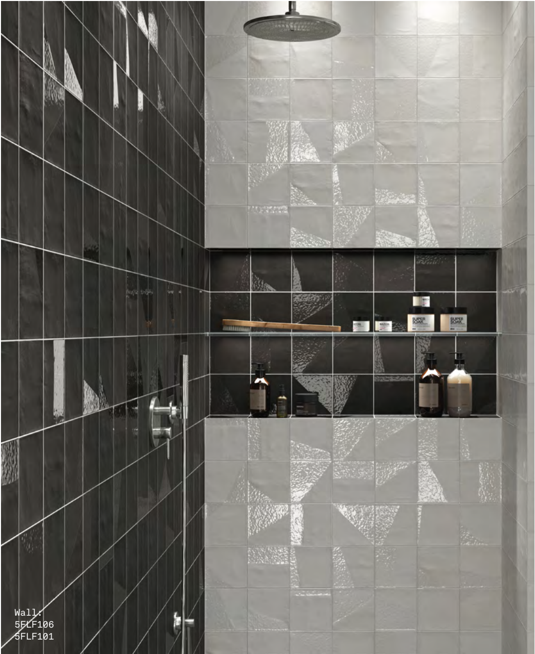
Wall: 5FLF106 5FLF101