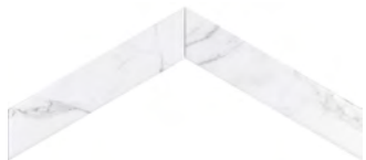
Ionic * 5ACH109