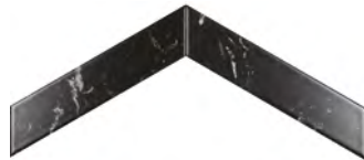
Harlen * 5ACH108