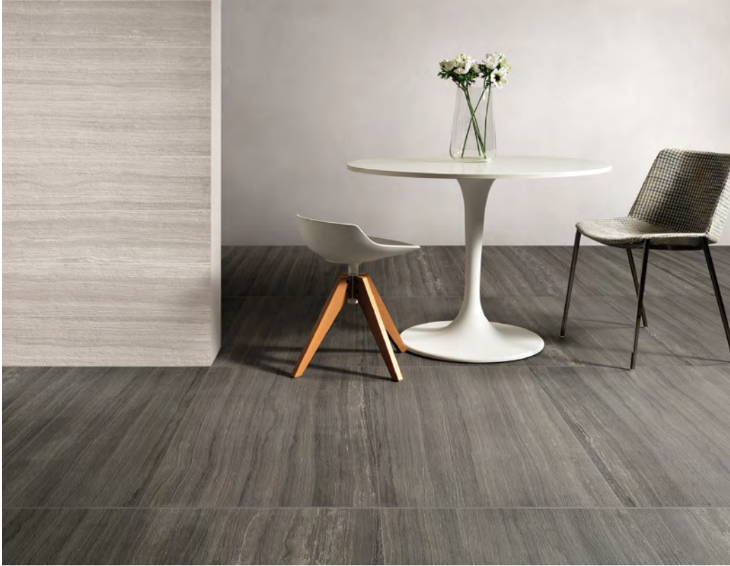
ABOVE Floor: 3FWL005 Wall: 3FWL002