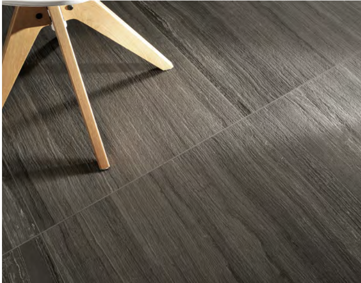
RIGHT Floor: 3FWL005