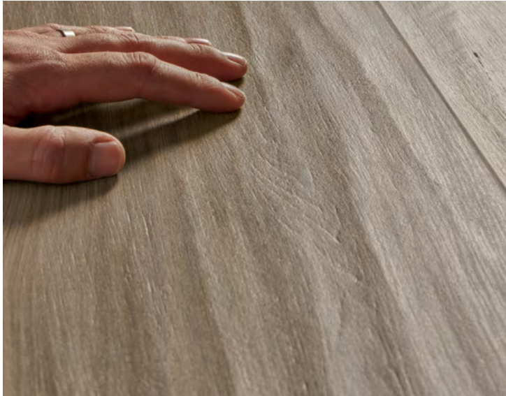
RIGHT Floor: 3GRA103