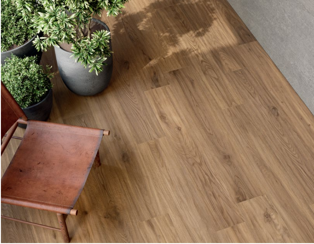
ABOVE Floor: 3GRA102