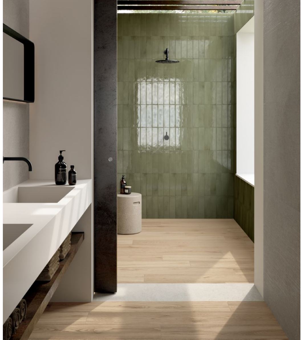
ABOVE Floor: 3GRA101