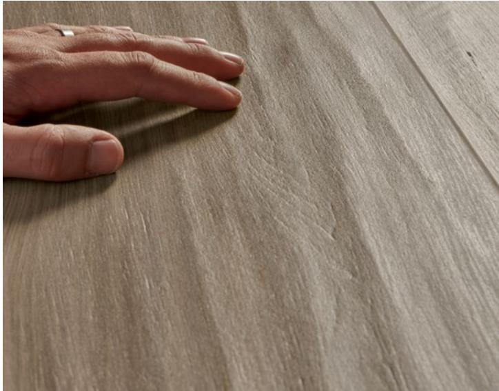
RIGHT Floor: 3GRA103