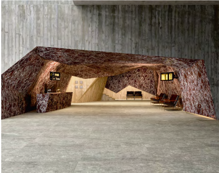
RIGHT Floor: 3GVS103