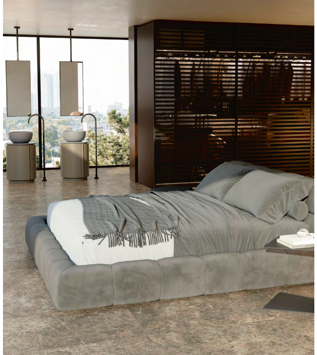
ABOVE Floor: 3GVS105