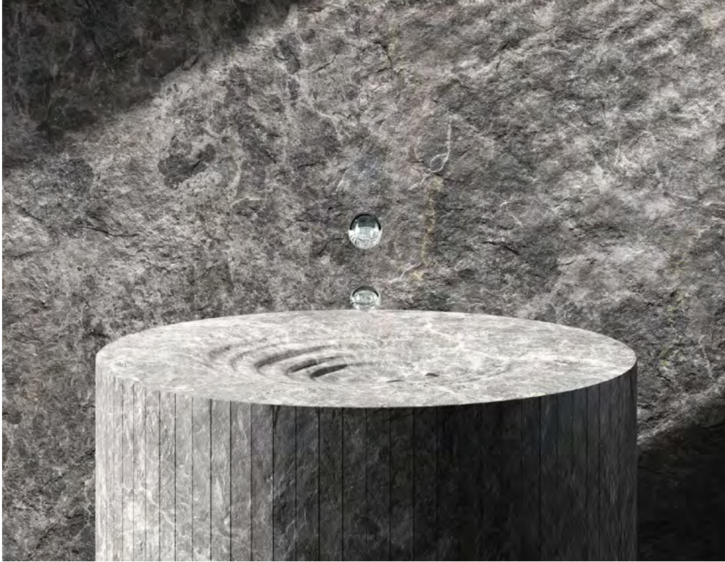
ABOVE Wall: 3GVS102