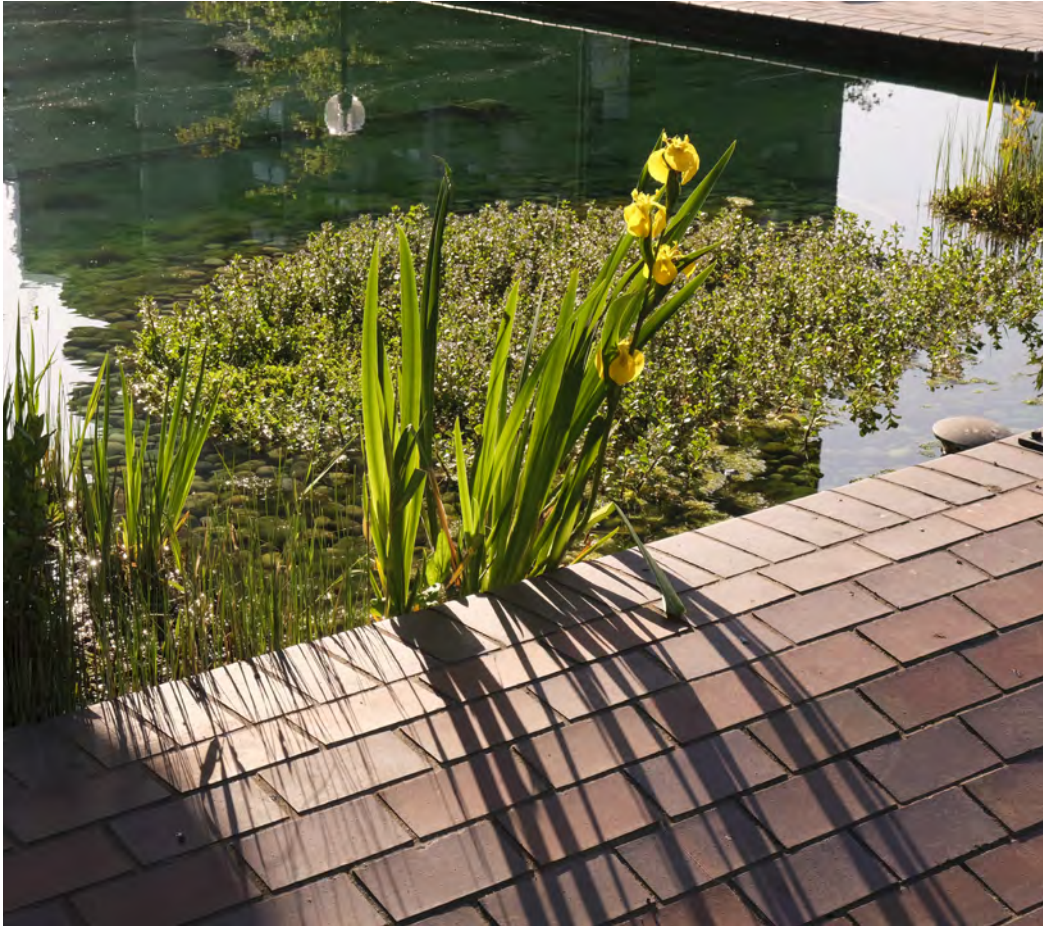
ABOVE Floor: 2KET104