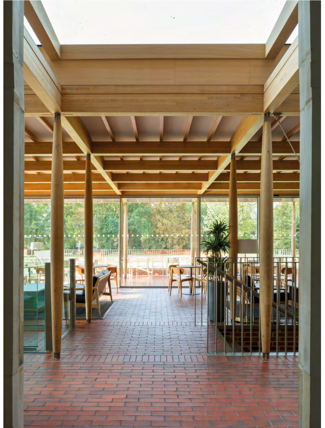
RIGHT Floor: 2KET104