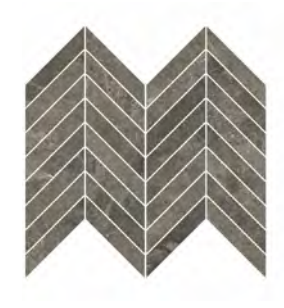
LKD-Dark Mosaic A 2LKD105M005 260x325x9mm Polished