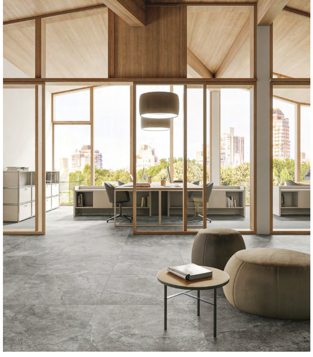
ABOVE Floor: 2LKD102