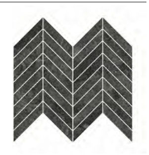
LKD-Coal Mosaic A 2LKD103M003 260x325x9mm Polished