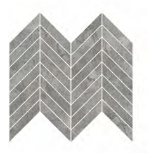
LKD-Ash Mosaic A 2LKD102M002 260x325x9mm Polished