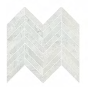
LKD-Ice Mosaic A 2LKD101M001 260x325x9mm Polished