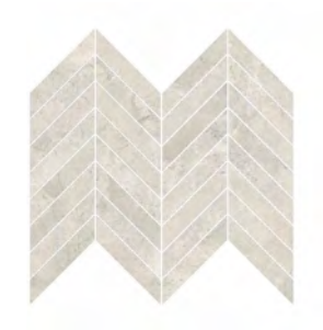
LKD-Pale Mosaic A 2LKD104M004 260x325x9mm Polished