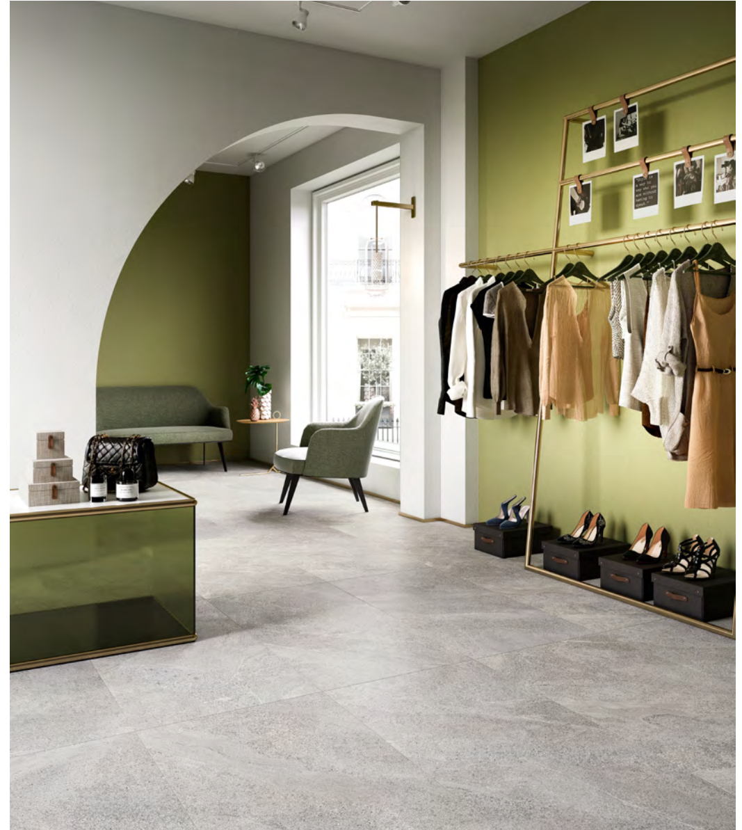
ABOVE Floor: 2LAK101