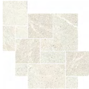
Mosaic A Natural 300x300x9mm Available in all colours