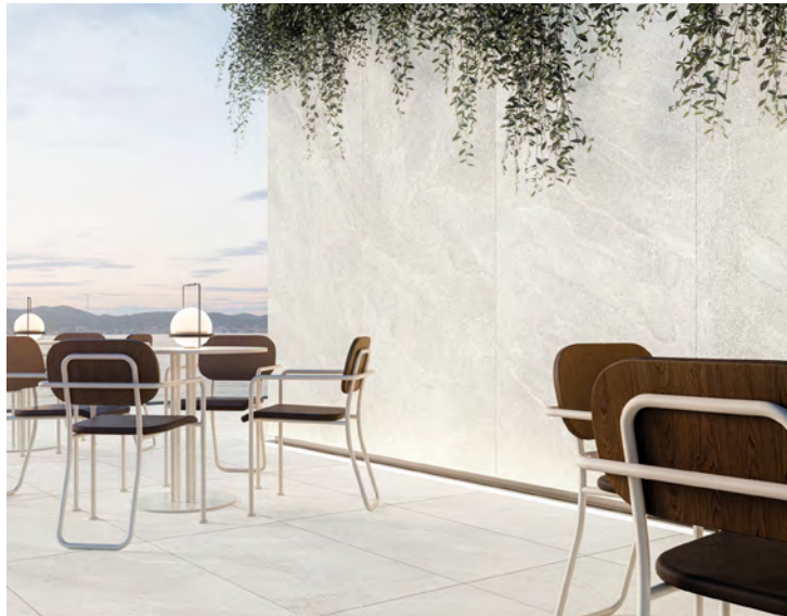
RIGHT Floor: 2LAK103 Wall: 2LAK103