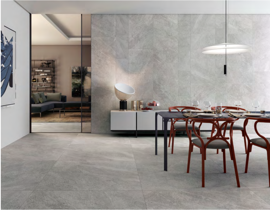
ABOVE Floor: 2LAK101 Wall: 2LAK101