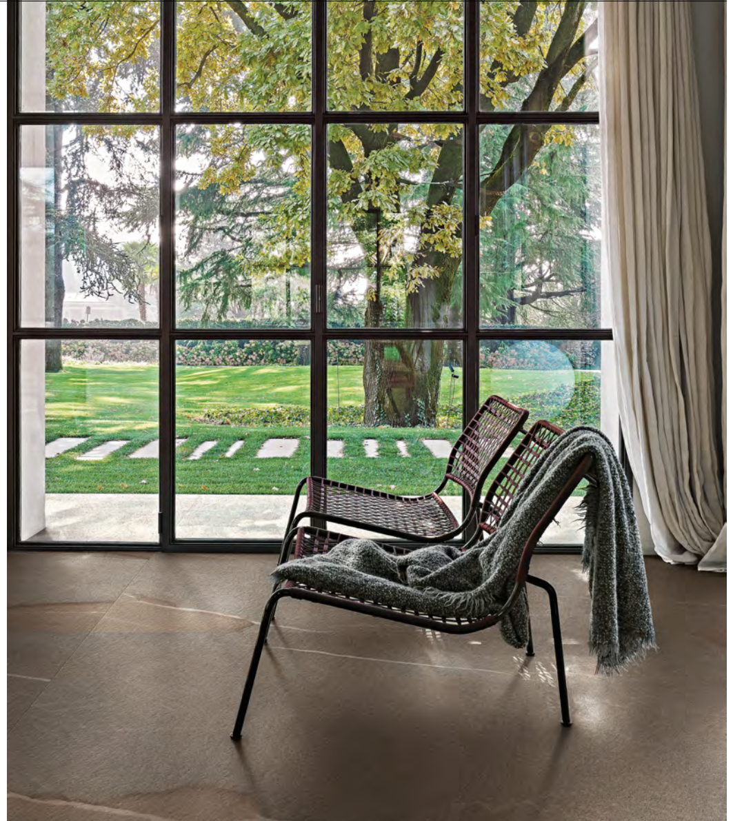
ABOVE Floor: 3MS0104 3MS0102