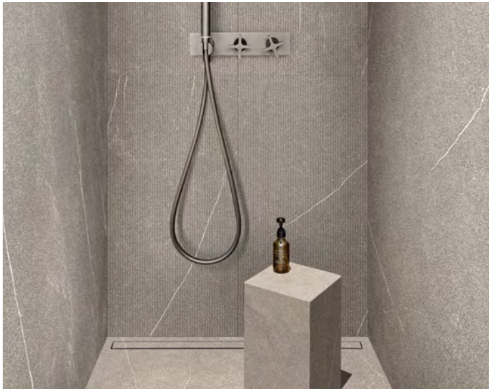
RIGHT Floor: 3MS0102 Wall: 3MS0102D001 3MS0102