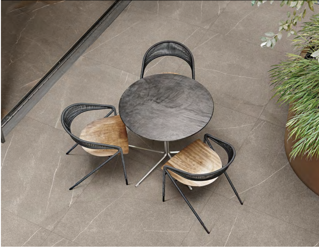
ABOVE Floor: 3MS0102