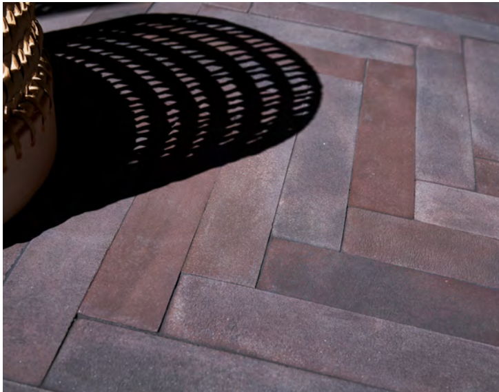
RIGHT Floor: 2MTA106