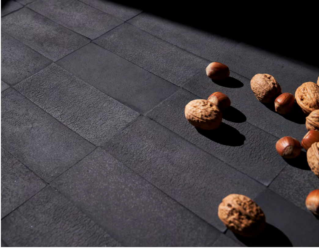
ABOVE Floor: 2MTA105