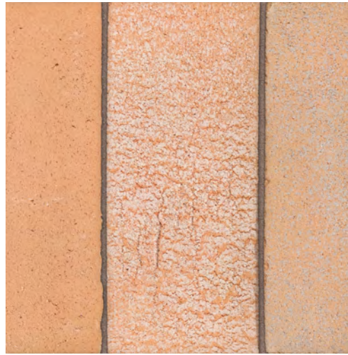
MTA-Sand * 2MTA108