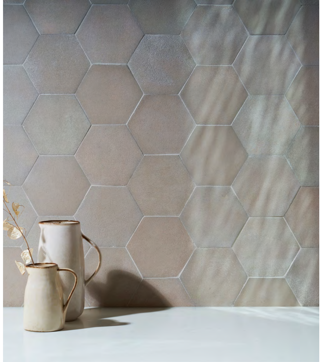
ABOVE Wall: 2MTA102