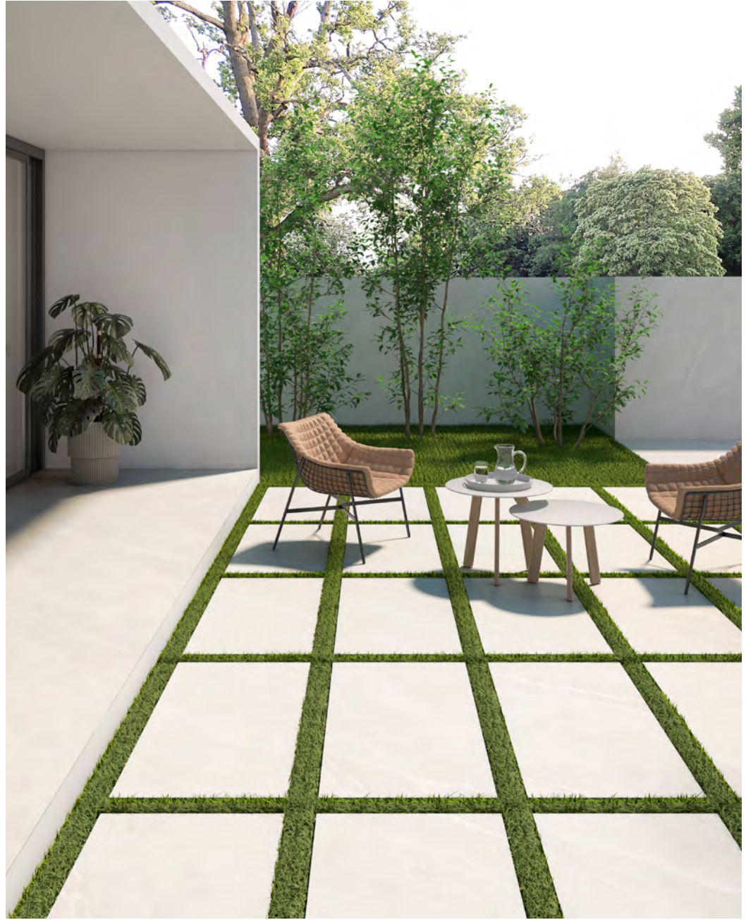
ABOVE Floor: 30UT115