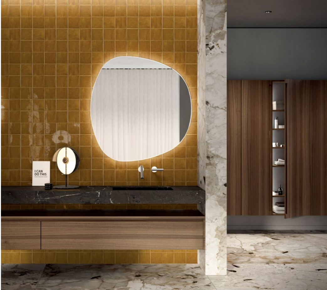
ABOVE Wall: 2PLL108