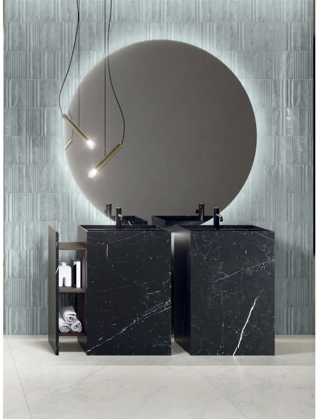
RIGHT Wall: 2PLL113 2PLL113D001 2PLL113D002