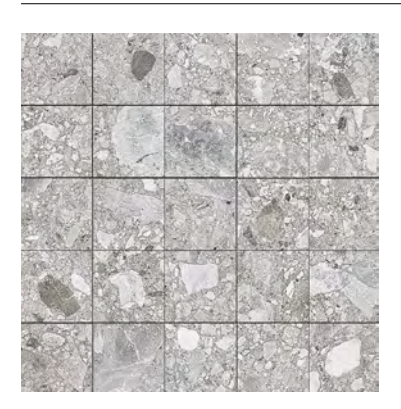
Mosaic A Available in all colours 300x300x9 (60x60 Chips) Matt Anti Slip R11 (A+B+C)