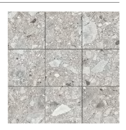
Mosaic B Available in all colours 300x300x9 (100x100 Chips) Matt Anti Slip R11 (A+B+C)