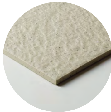
Anti Slip Textured R11 (A+B)