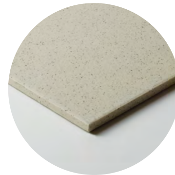
Anti Slip R11 (A+B)