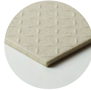
Anti Slip R12 (A+B+C) V4