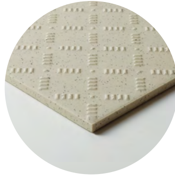
Anti Slip R12 (A+B+C) V8