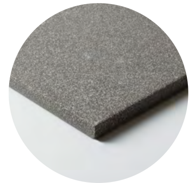
Anti Slip R10