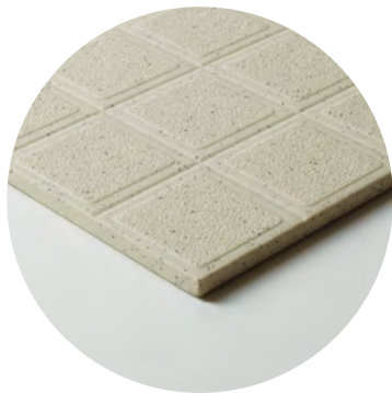
Anti Slip R11 (A+B+C) V4