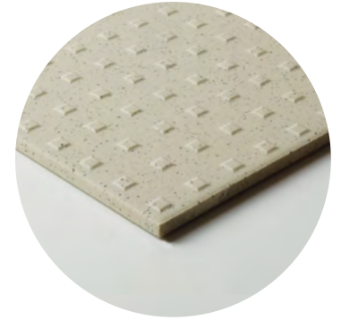
Anti Slip R11 (A+B+C) V6