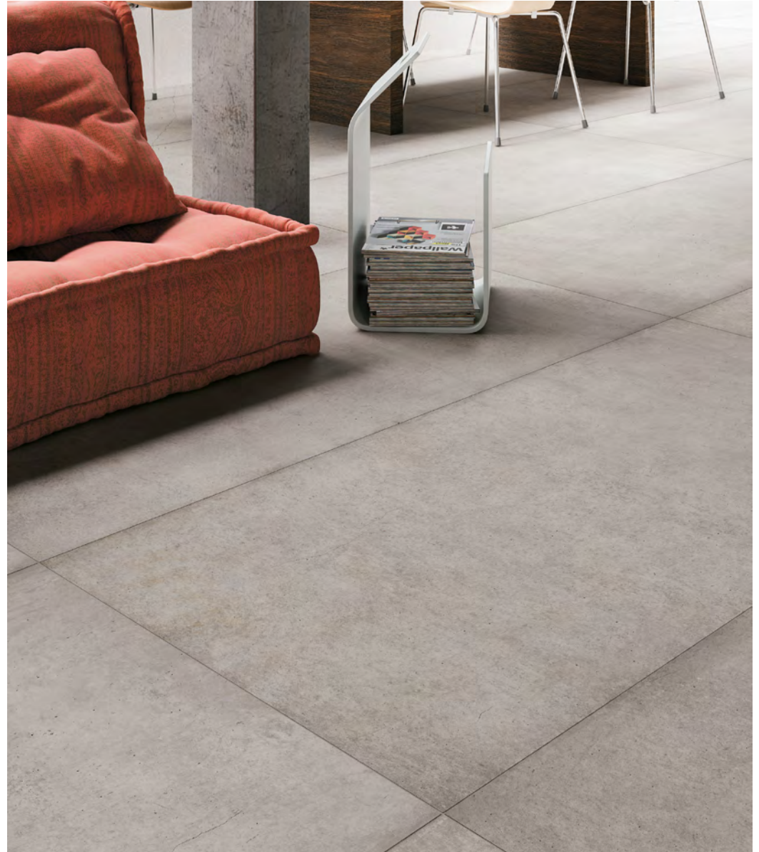
ABOVE Floor: 2YSC104