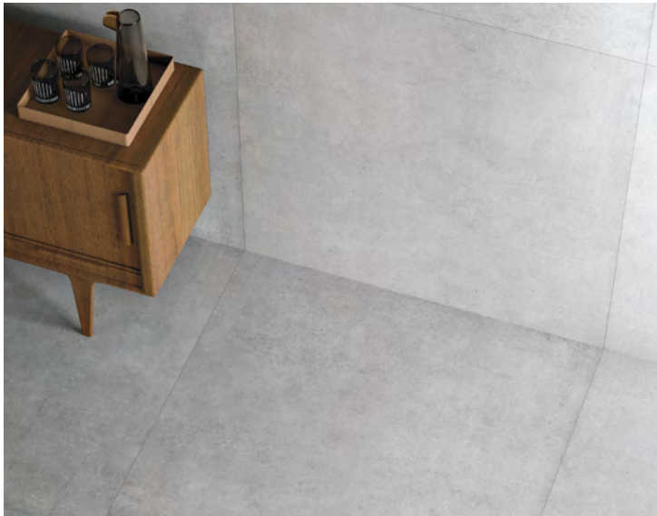
RIGHT Floor: 2YSC102 Wall: 2YSC102