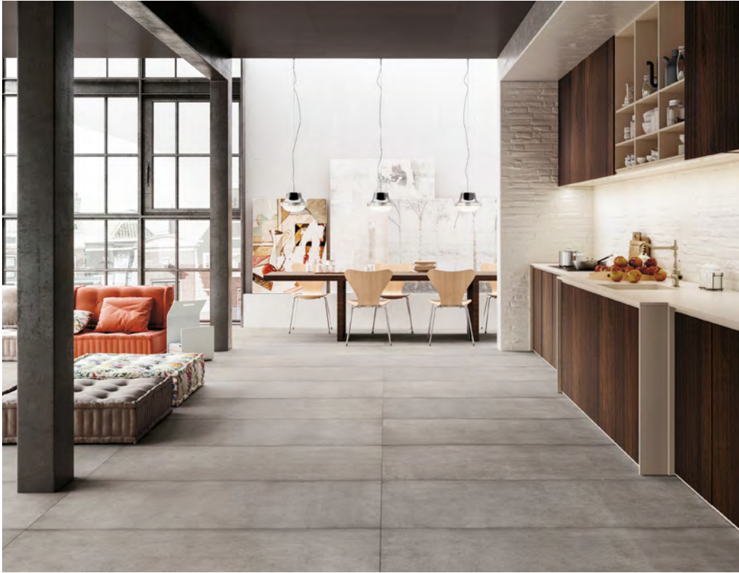
ABOVE Floor: 2YSC104