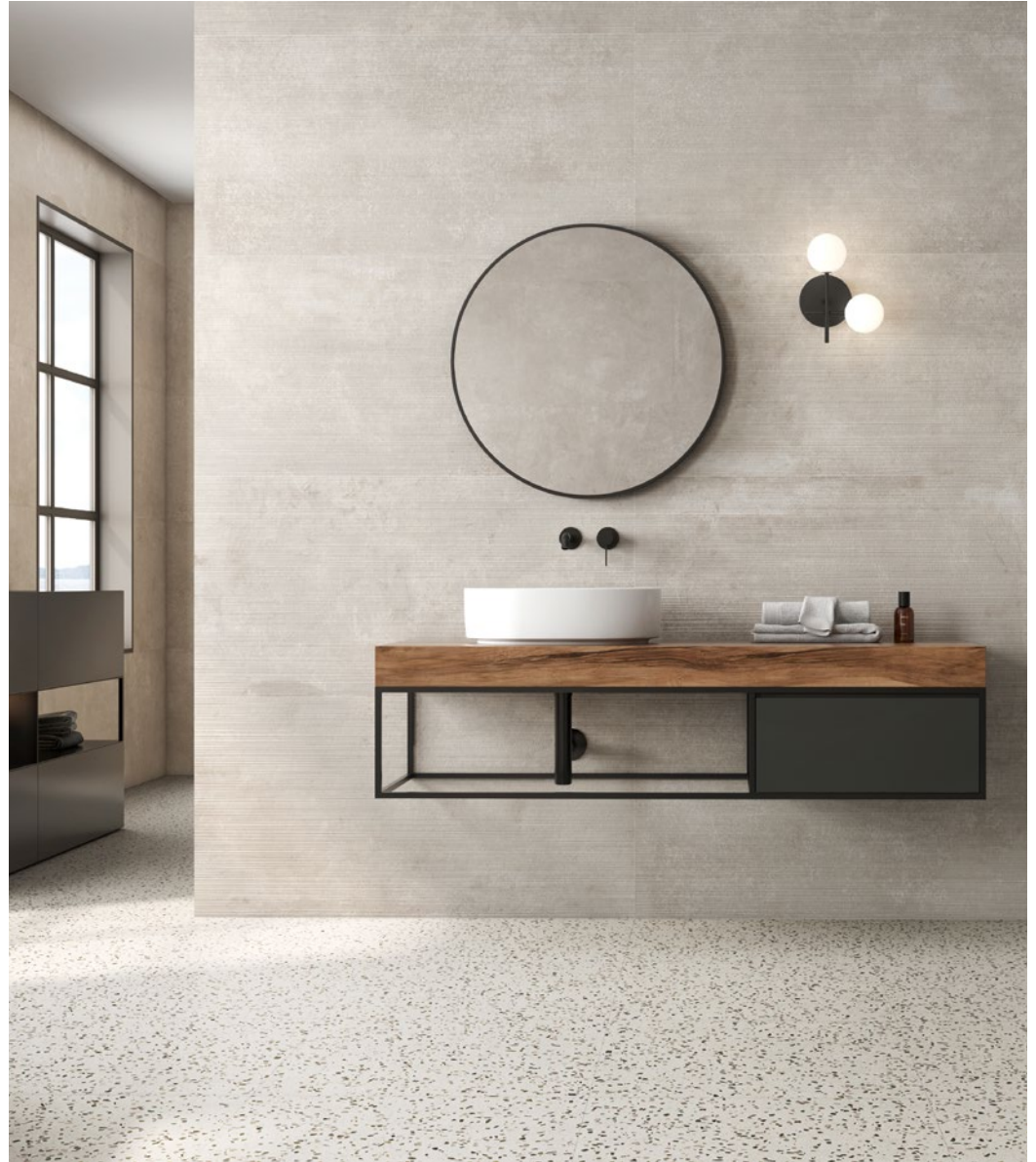
ABOVE Wall: 2SVT101 2SVT102D001