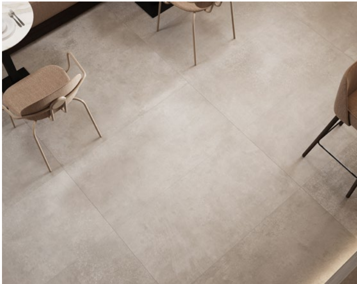
RIGHT Floor: 2SVT104