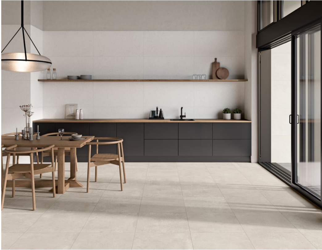
ABOVE Floor: 2SVT101