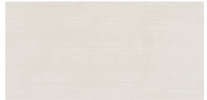
Mosaic Available in all colours 300x300x9mm Matt R9