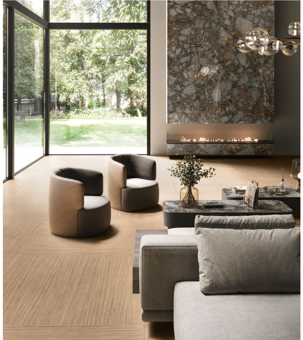
ABOVE Floor: 3SER108