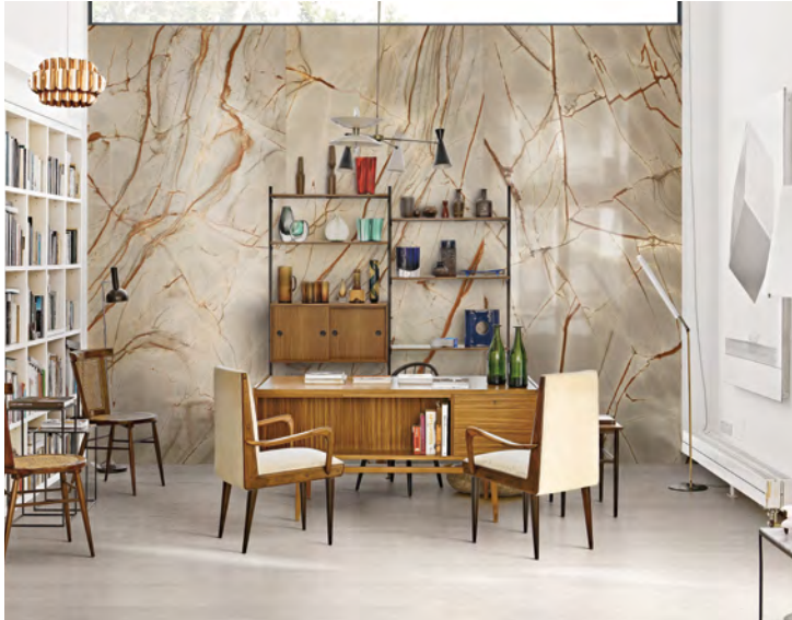
RIGHT Wall: 3SER103