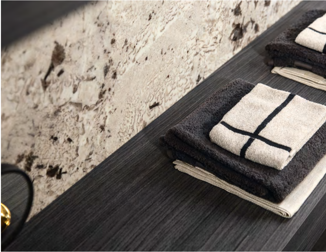
ABOVE Wall: 3SER101