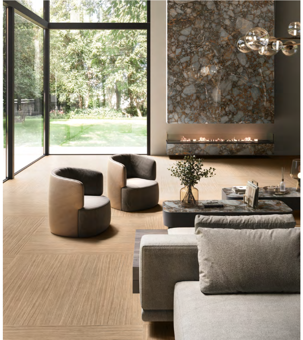
ABOVE Floor: 3SER108