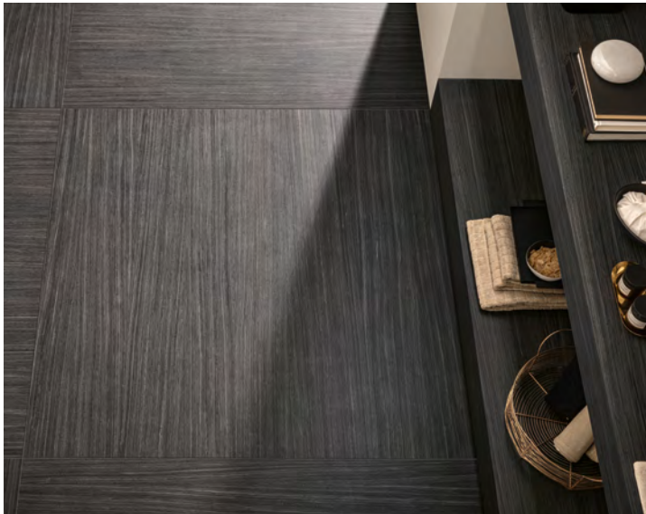
RIGHT Floor: 3SER111