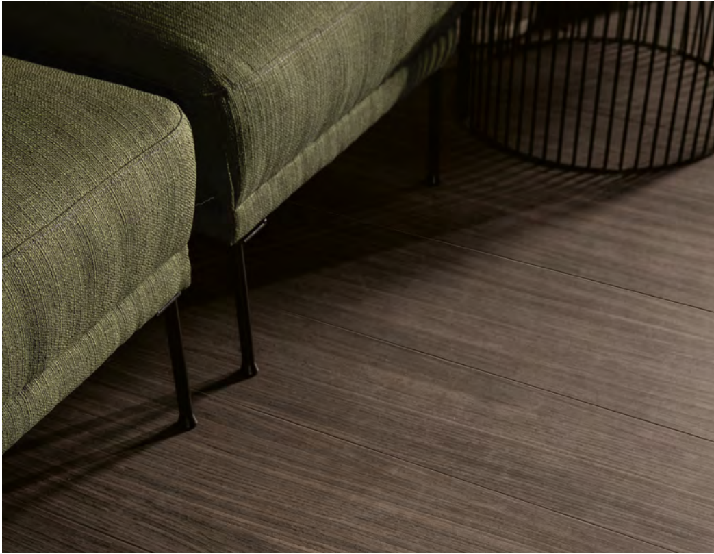
ABOVE Floor: 3SER110