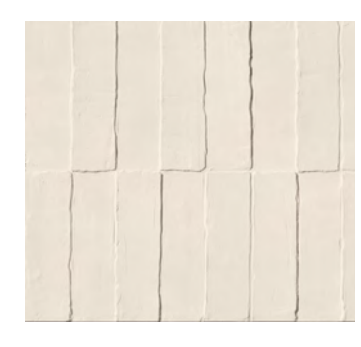
WAV-White 5WAV101 Textured Block Finish