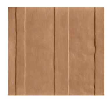
WAV-Terra 5WAV103 Textured Groove Finish