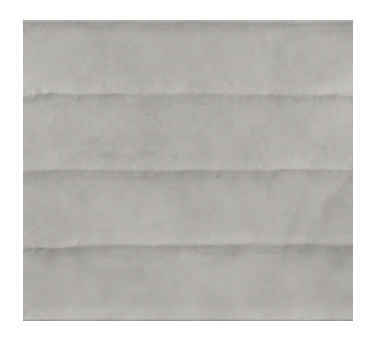
WAV-Grey 5WAV102 Textured Wave Finish