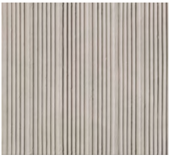
WAV-Grey 5WAV102 Textured Line Finish