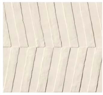
WAV-White 5WAV101 Textured Diagonal Finish