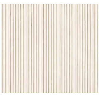
WAV-White 5WAV101 Textured Line Finish