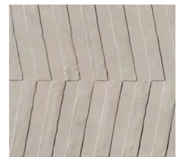
WAV-Grey 5WAV102 Textured Diagonal Finish