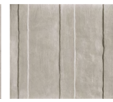
WAV-Grey 5WAV102 Textured Groove Finish