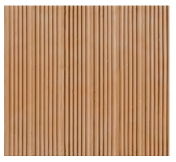
WAV-Terra 5WAV103 Textured Line Finish