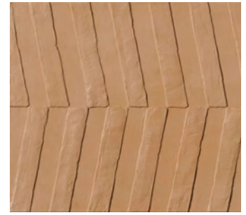
WAV-Terra 5WAV103 Textured Diagonal Finish