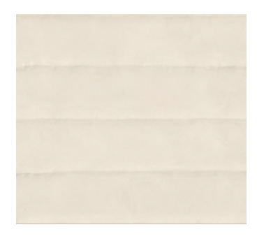
WAV-White 5WAV101 Textured Wave Finish