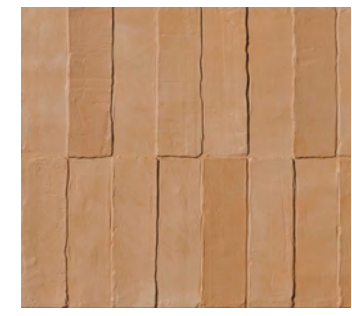
WAV-Terra 5WAV103 Textured Block Finish