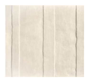
WAV-White 5WAV101 Textured Groove Finish