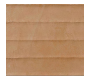
WAV-Terra 5WAV103 Textured Wave Finish