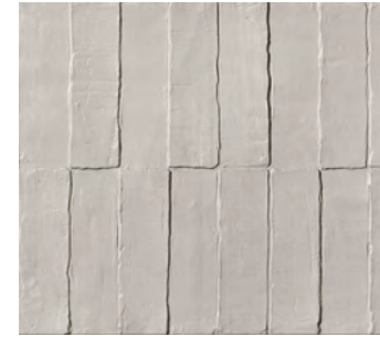
WAV-Grey 5WAV102 Textured Block Finish