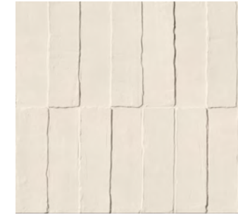
WAV-White 5WAV101 Textured Block Finish