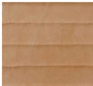
WAV-Terra 5WAV103 Textured Wave Finish