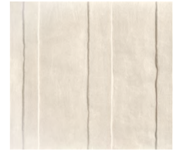
WAV-White 5WAV101 Textured Groove Finish