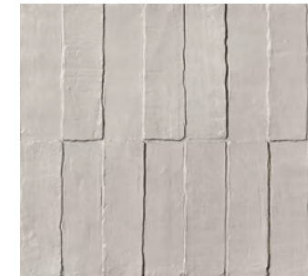
WAV-Grey 5WAV102 Textured Block Finish