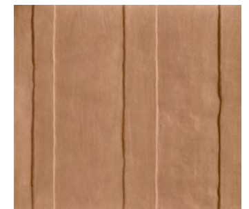
WAV-Terra 5WAV103 Textured Groove Finish