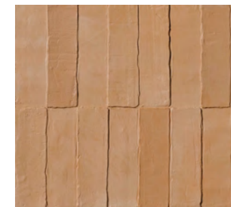
WAV-Terra 5WAV103 Textured Block Finish