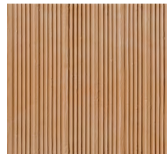
WAV-Terra 5WAV103 Textured Line Finish