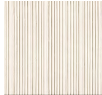
WAV-White 5WAV101 Textured Line Finish