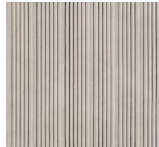
WAV-Grey 5WAV102 Textured Line Finish