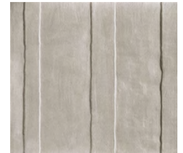
WAV-Grey 5WAV102 Textured Groove Finish